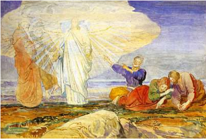
Painting: "Transfiguration" by Alexandr Ivanov, 1824