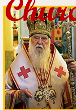
His Holiness Patriarch Philaret