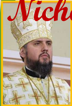
The Blessed Metropolitan Epifaniy

Stavropigia of the Orthodox Church of Ukraine Very Reverend Bohdan Zhoba, Rector