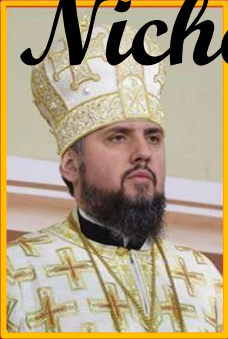
The Blessed Metropolitan Epifaniy