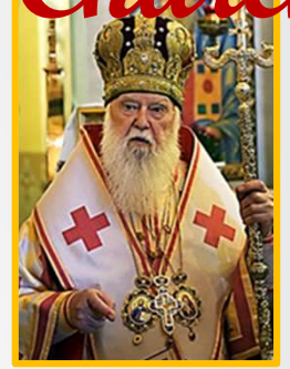
His Holiness Patriarch Philaret