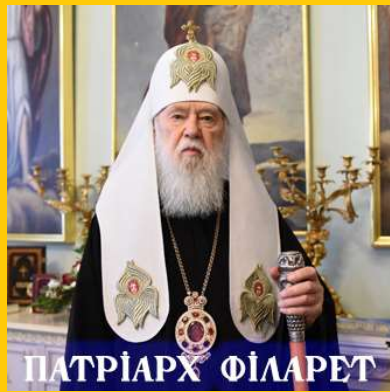
Patriarch Philaret Kyiv, Ukraine

Stavropigia of the Ukrainian Orthodox Church, Kyivan Patriarchate Bulletin for Sunday, December 27, 2020