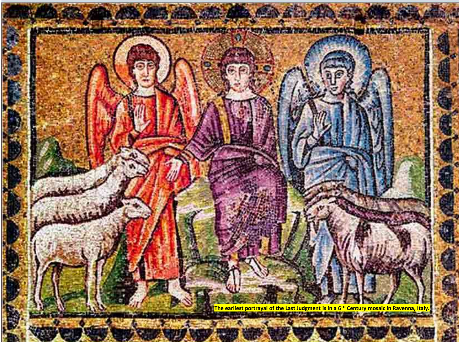
The earliest portrayal of the Last Judgment is in a 6 th Century mosaic in Ravenna, Italy.

“When the day of judgment comes, all men shall be gathered before the throne of the Son of man, and the King shall separate the good from the bad, as a shepherd separates the sheep of his flock from the goats. And He shall put the sheep at His right hand, and the goats at His left...” Matthew 25:32-33