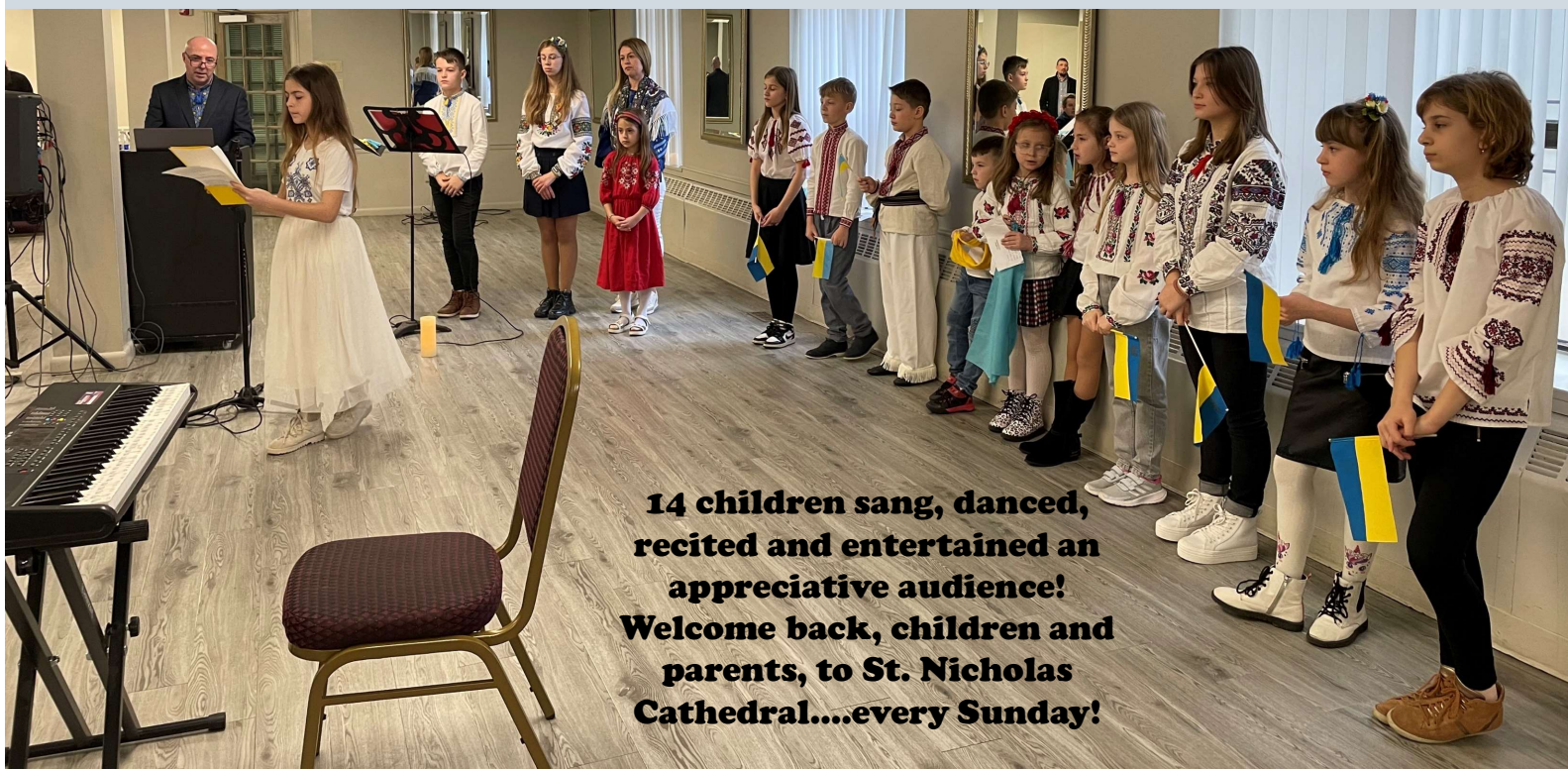
14 children sang, danced, recited and entertained an appreciative audience! Welcome back, children and parents, to St. Nicholas Cathedral...every Sunday!