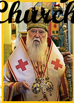
His Holiness Patriarch Philaret