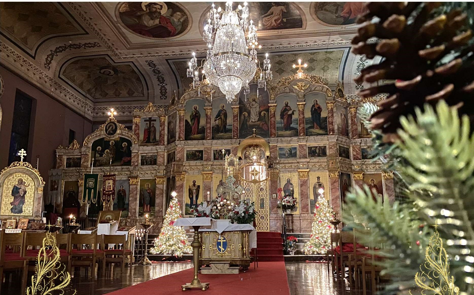
The Sanctuary was beautifully decorated for Christmas with white cloths covering the furnishings, lighted trees, 200 glowing vigils and fragrant, fresh floral arrangements.