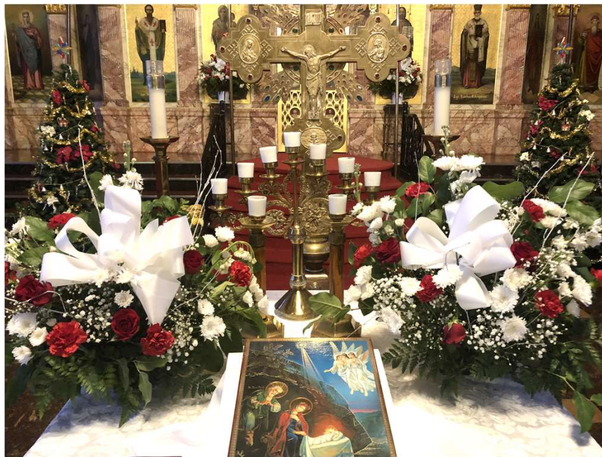
The Analoï table in the center of the Sanctuary with the Nativity Icon.