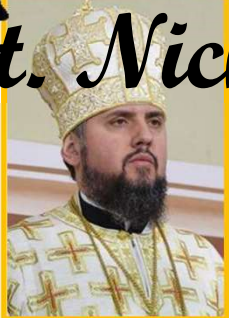
The Blessed Metropolitan Epifaniy

Stavropigia of the Orthodox Church of Ukraine Very Reverend Bohdan Zhoba, Rector