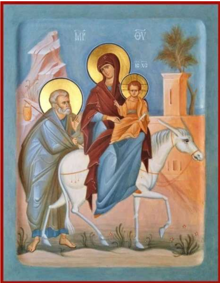
Icon Depicting the Holy Family's Flight Into Egypt.

Sunday, January 12, 2020 Matthew 2:13-23