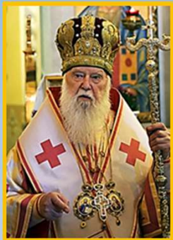
His Holiness Patriarch Philaret