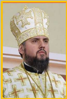
The Blessed Metropolitan Epifaniy