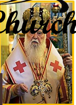
His Holiness Patriarch Philaret