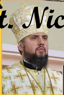
The Blessed Metropolitan Epifaniy

Stavropigia of the Orthodox Church of Ukraine Very Reverend Bohdan Zhoba, Rector