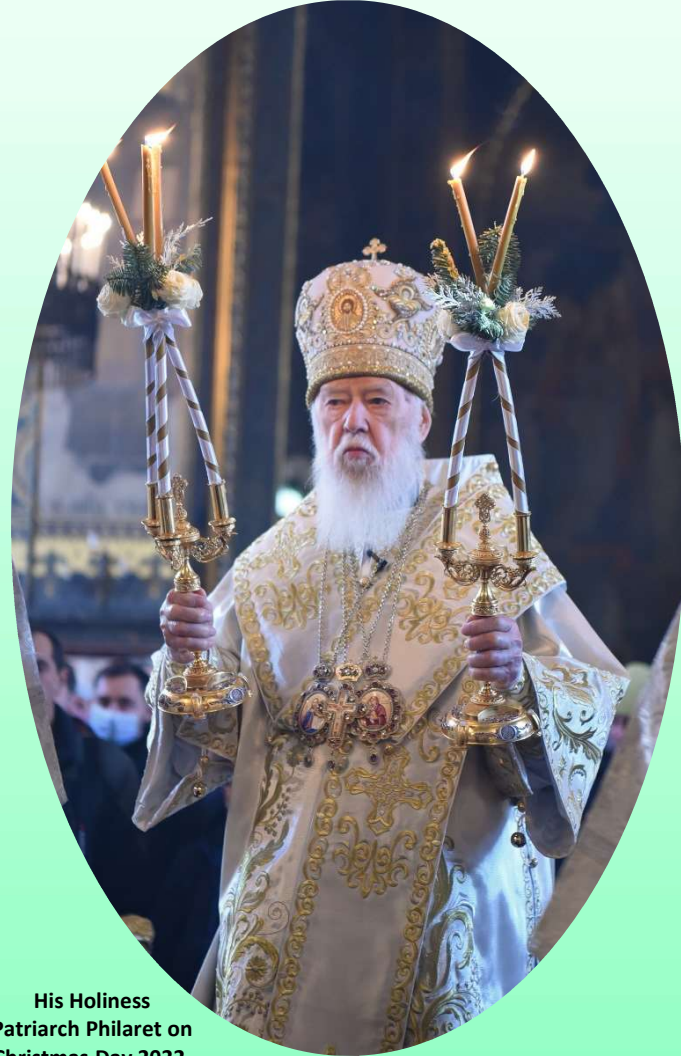
His Holiness Patriarch Philaret on Christmas Day 2022.

And this holiday is huge because it changed the lives of all mankind. The Nativity of our Lord Jesus Christ, the Son of God, who humbled Himself and came to earth born of the Holy Spirit and the Blessed Virgin Mary, changed our way of life. That is why we rejoice and sing carols. And you feel the joy that comes during these Christmas holidays. I congratulate you on this holiday and pray that the Lord Jesus Christ will help us to have a righteous life.