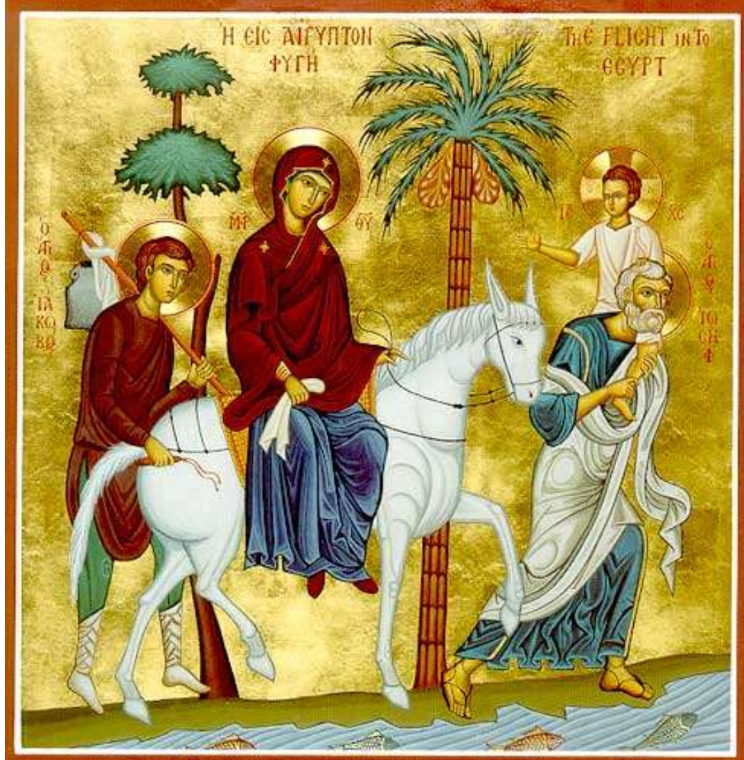
Flight of the Holy Family into Egypt to escape Herod.

Last week's Scripture reading and sermon were joyful! We heard about the birth of Jesus Christ as witnessed by the angels, shepherds, Mary and Joseph – and everyone celebrated the Nativity.