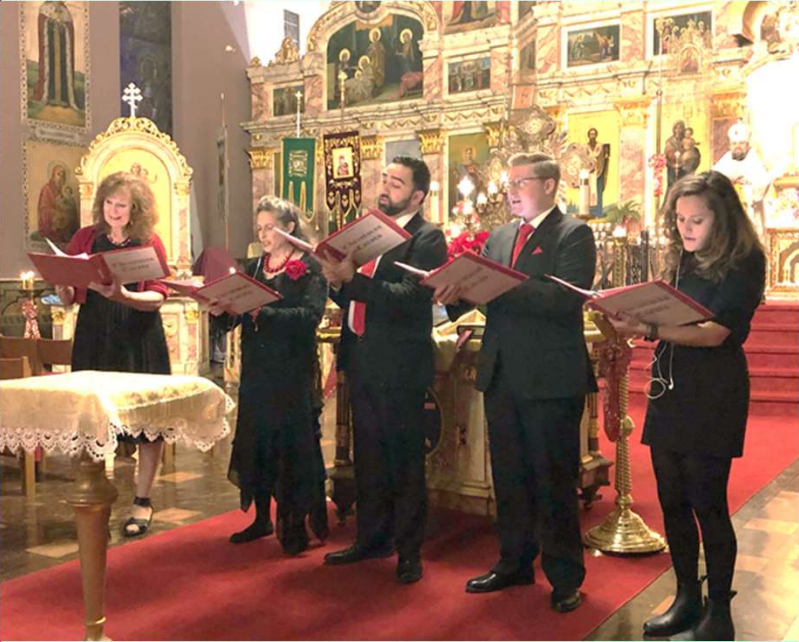
The Patriarchal Choir caroling in the Sanctuary.

200 vigils -- for the health of and in memory of your loved ones -- illumined the Sanctuary on Christmas Eve and Christmas Day.