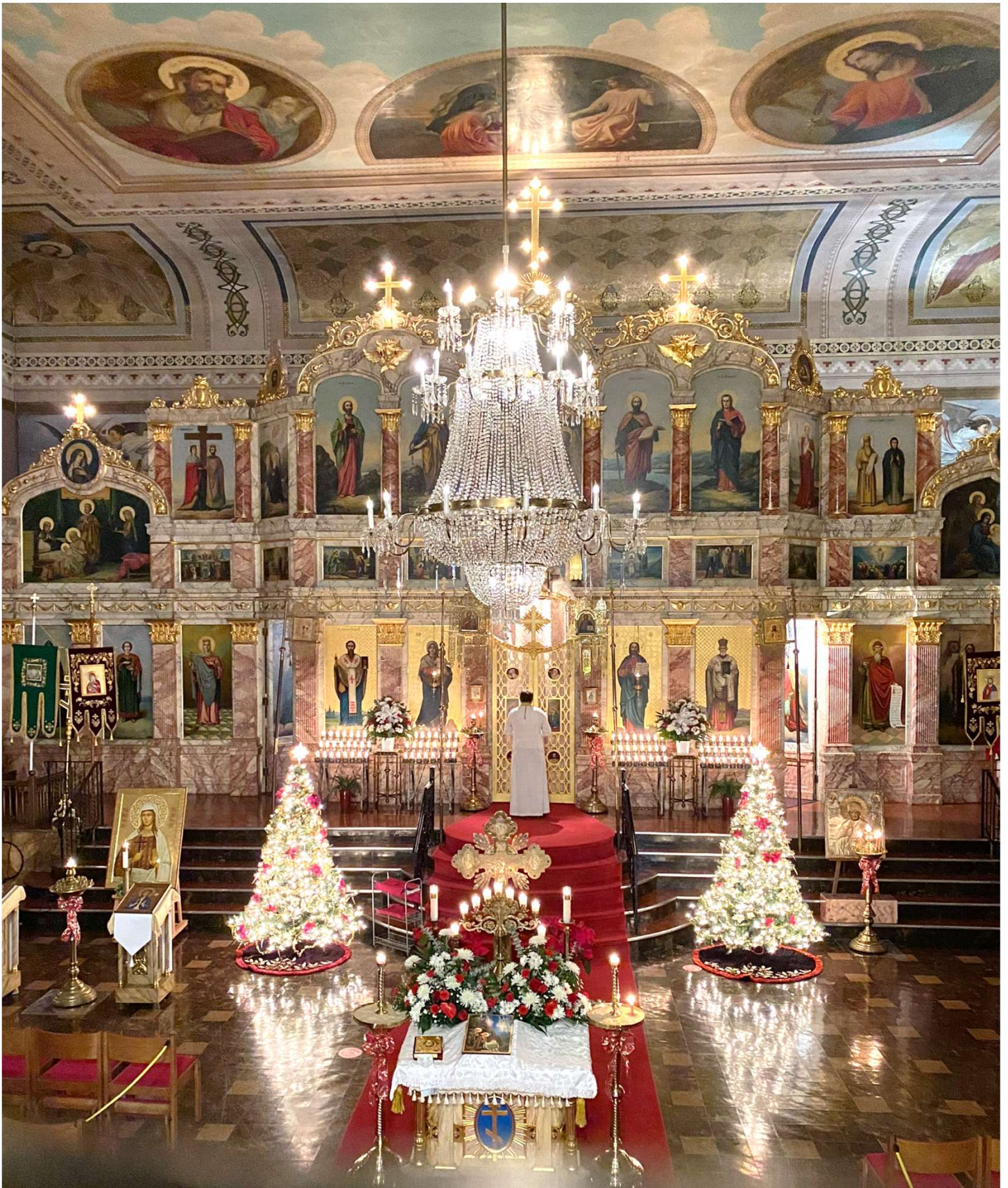
Imagery from Christmas Eve Service at St. Nicholas Church January 6, 2021