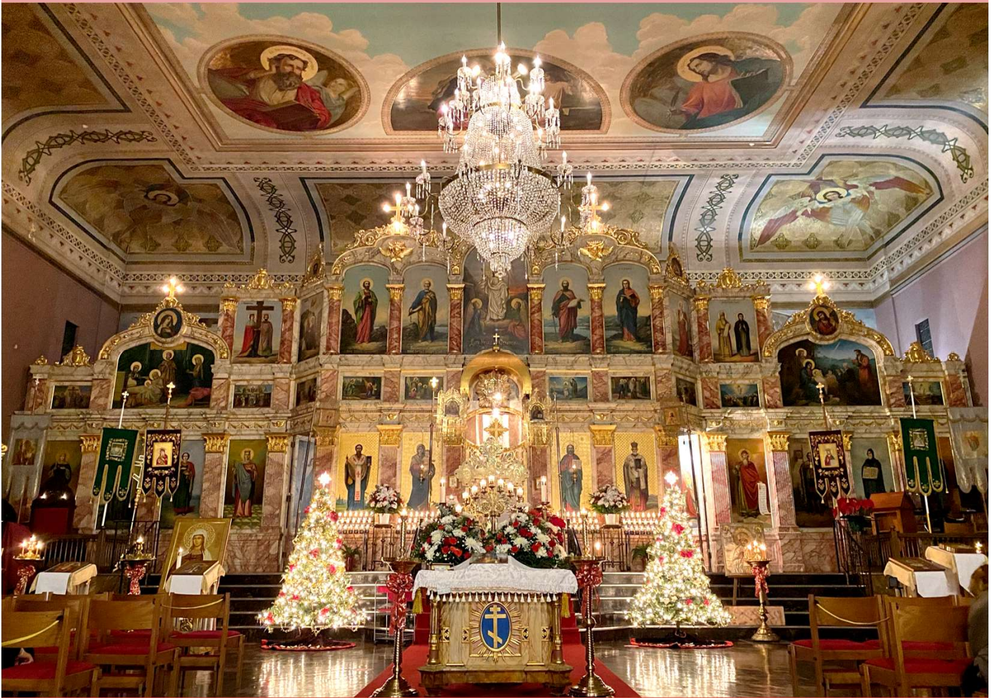
The Sanctuary was illumined on Christmas Eve with 200 vigil candles and brightly-lit Christmas trees. Fresh flowers on the anamorphic table and altar added to the splendor.