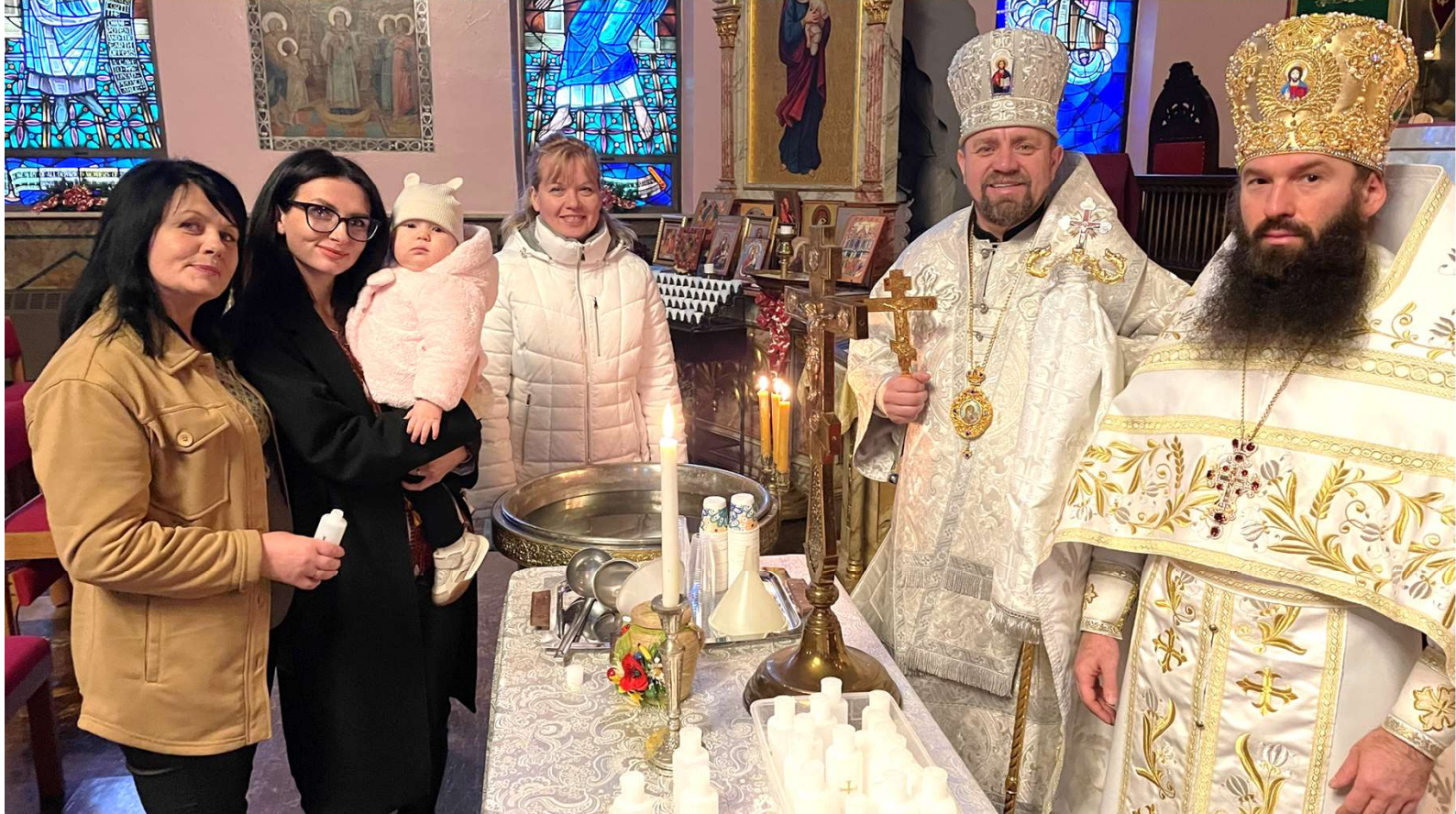
Following Divine Liturgy, Feast of Theophany, January 19, 2023