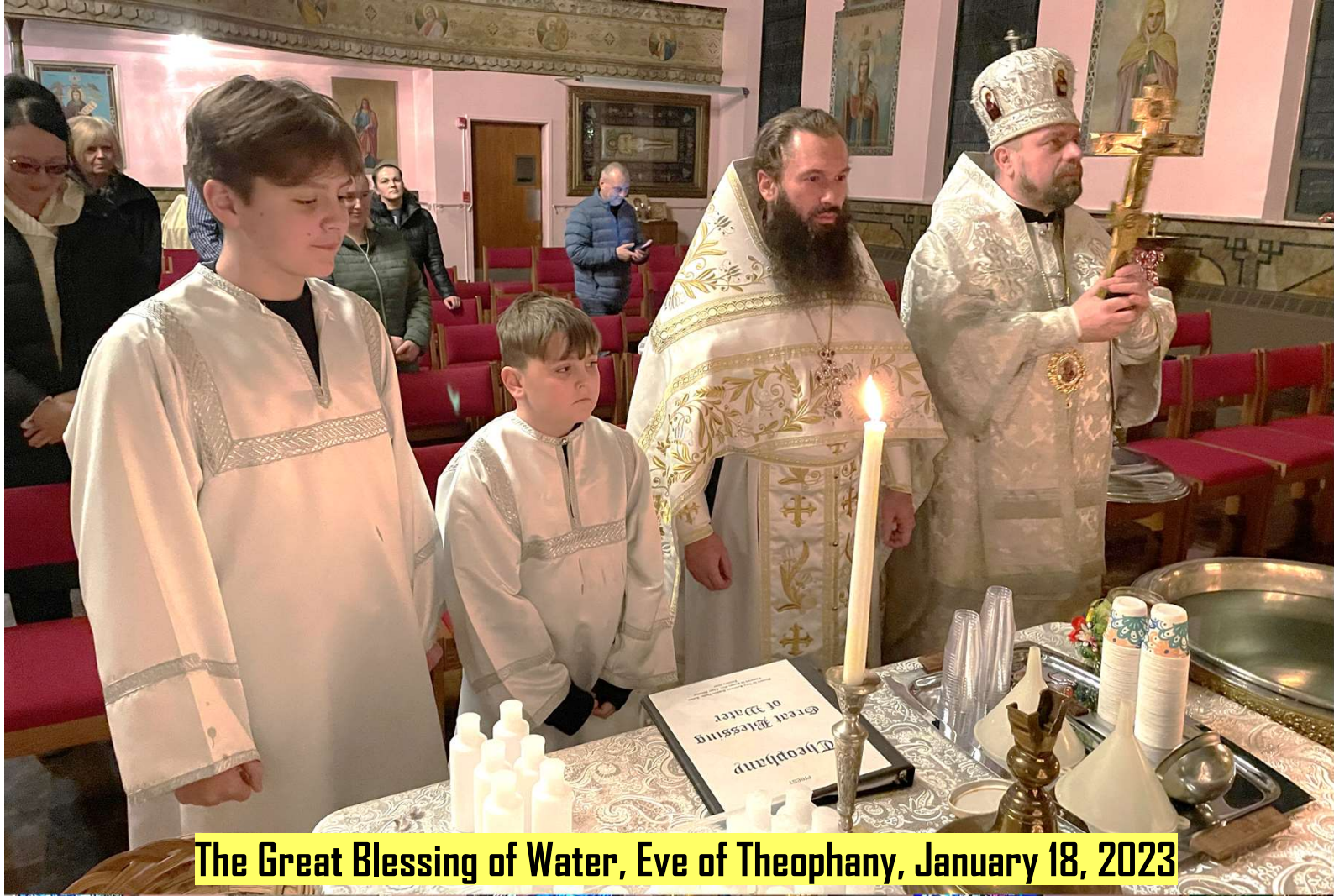
The Great Blessing of Water, Eve of Theophany, January 18, 2023