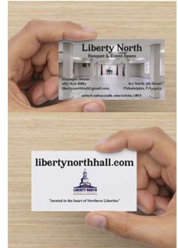
New business cards