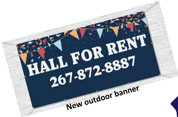
New outdoor banner