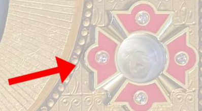
The decorative theca with relics of St. Justina.