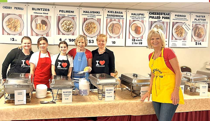
Pierogi Festival 2022

Event details: @stnicholaseoc or call 215-922-9671