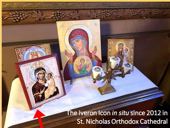
The Iveron Icon in situ since 2012 in St. Nicholas Orthodox Cathedral