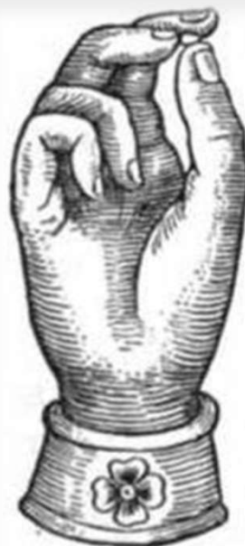
Position of the fingers of the right hand in making the sign of the cross

"Take up your cross and follow me," said Jesus Christ. And we should do just that: literally and symbolically. We venerate the Holy Cross today on this 3 rd Sunday of Great Lent as a reminder of Jesus' sacrifice for us on the cross -- and also to remind ourselves that this is the goal of our Lenten journey. But we also venerate the cross because Jesus said: "He who does not take up his cross and follow Me is not worthy of Me." It is a simple statement that defines how we must live to be saved. The cross represents Jesus, and you should wear your cross so that everyone can see that you believe in the power of the crucifix and that God is with you always. The cross symbolizes that you are a disciple of Christ, which means you have chosen to follow Him on your journey through life. It is a winding road of bumps and potholes. We try to be obedient to Christ and His teachings, listening to the messages He gives us through the parables -- but we often stumble when we are discouraged or tempted by worldly things. Yet we always get back up because we have faith. You are on your journey as a disciple of Christ. And that is why during Great Lent you deny your SELF. Because only when you deny SELF -- or abstain from things during Great Lent -- can you take up your cross and follow Jesus.