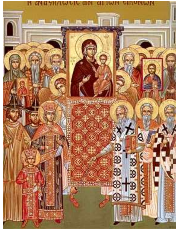
An Icon depicting the triumph of Orthodoxy.

The collage of icons on the cover of this week's Bulletin was designed to commemorate Orthodoxy Sunday and the return of icons into churches in the year 843 following a great conflict between the Iconoclasts and Iconophiles. The Iconophiles prevailed and we celebrate this victory on Sunday, March 21, on Orthodoxy Sunday.