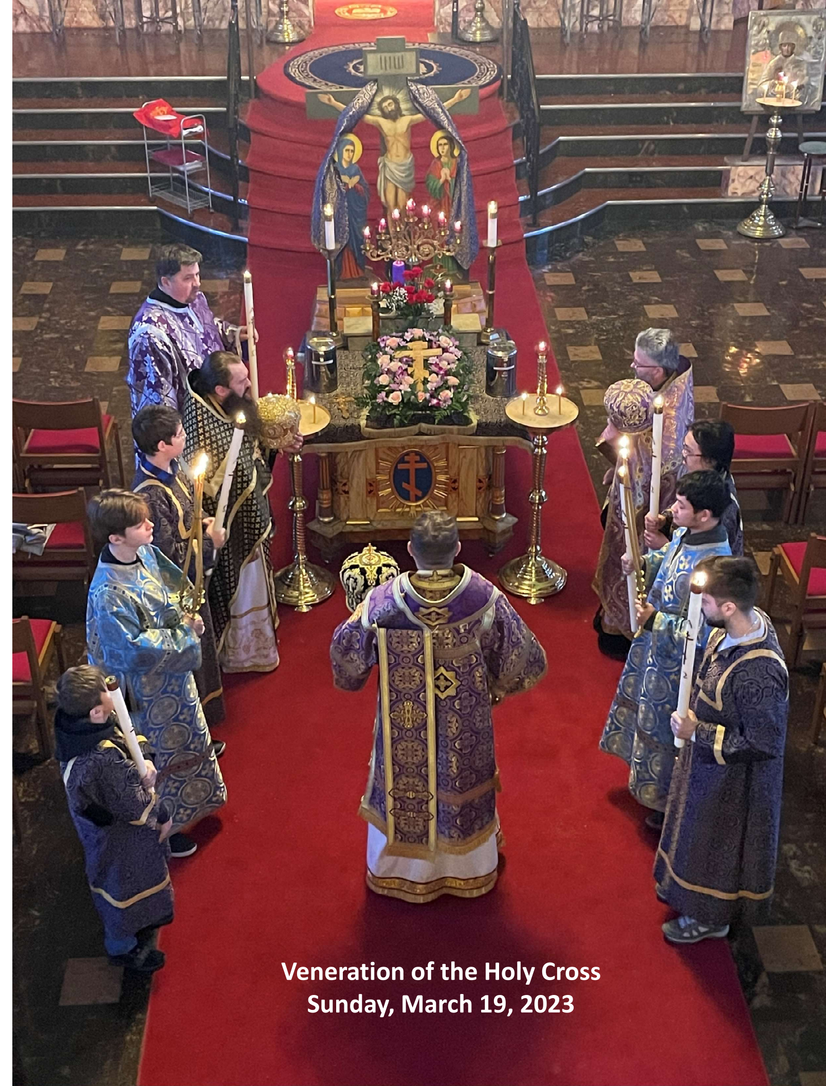
Veneration of the Holy Cross Sunday, March 19, 2023