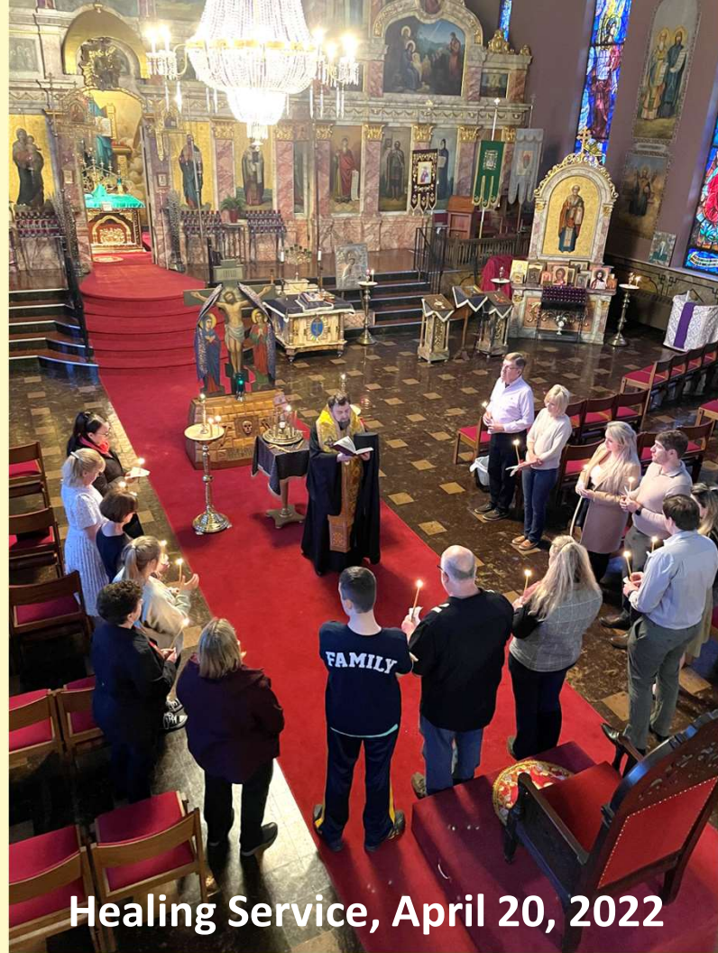
Healing Service, April 20, 2022