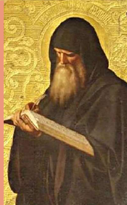
St. John Climacus c 579-649 AD

On this 4 th Sunday of Great Lent, the Church commemorates Saint John Climacus, also known as Saint John of the Ladder, author of the classic ascetic text, "The Ladder of Divine Ascent." Originally written for monks in c. AD 600, the treatise instructs how to avoid vice and practice virtue so that at the end, salvation can be obtained. "The Ladder," a guide for practicing a life completely and wholly devoted to God, has become one of the most highly influential and important works used by the Church.