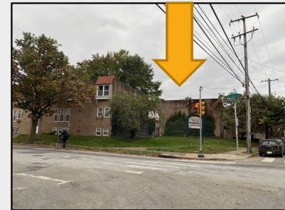
VIEW FROM 6TH STREET