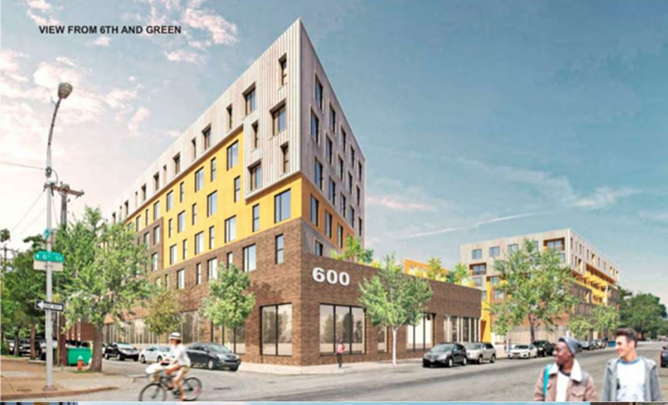
VIEW FROM 6TH AND GREEN