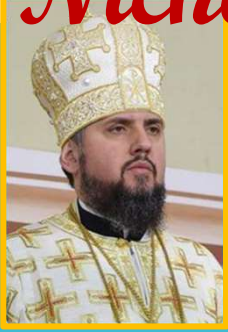
The Blessed Metropolitan Epifaniy