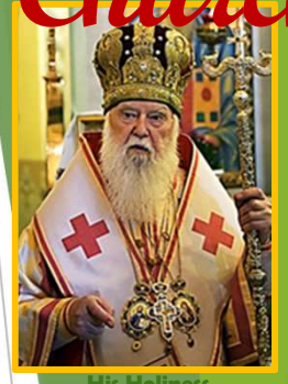
His Holiness Patriarch Philaret