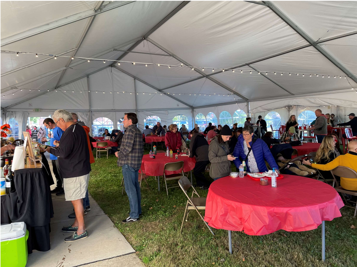
The crowd was directed into our adjacent 2,500 square foot, heated tent to enjoy outdoor dining. Several vendors flanked our walkway.