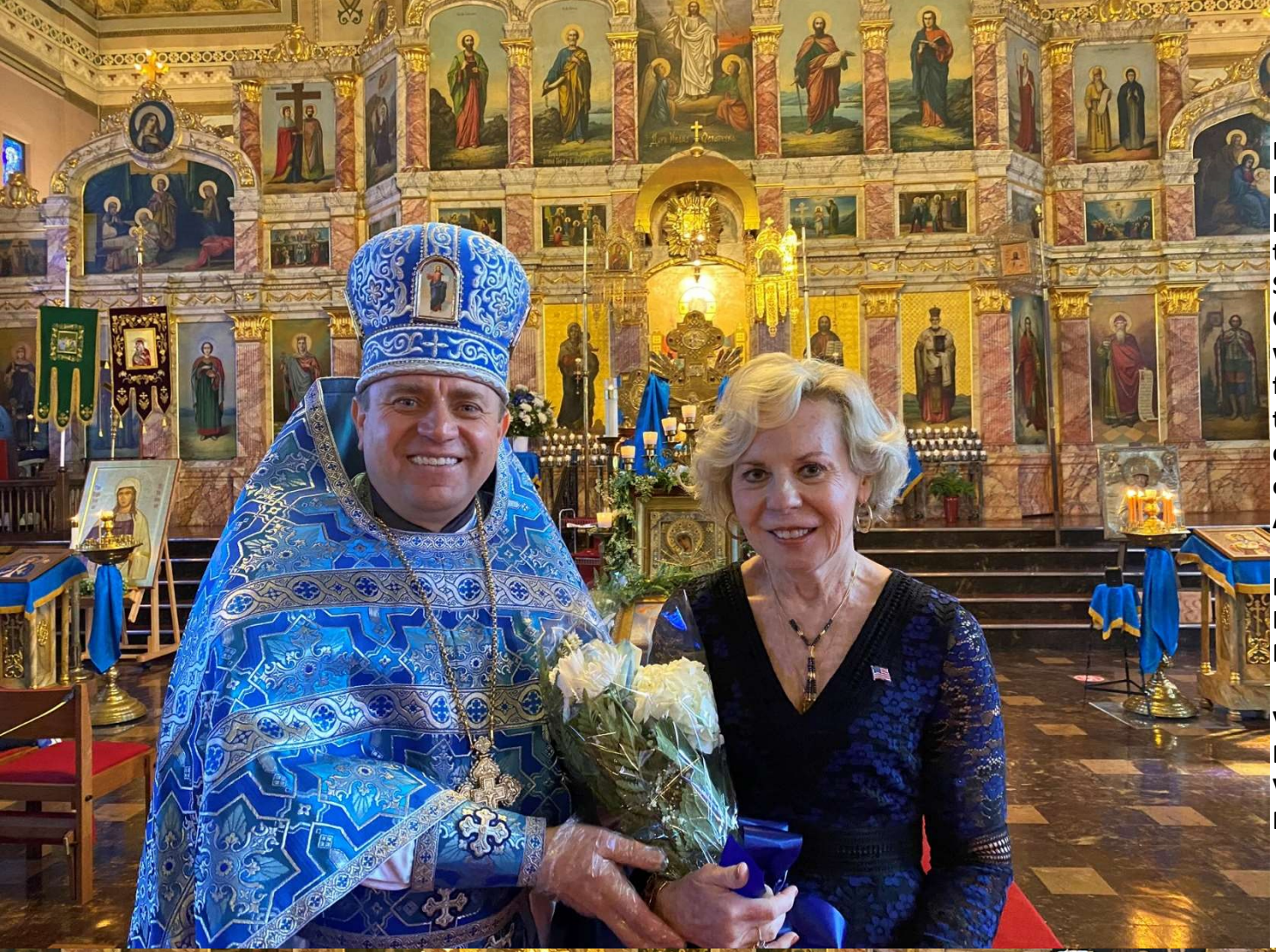
Father Bohdan presented the Sisterhood Council with flowers at the conclusion of the Akathist.