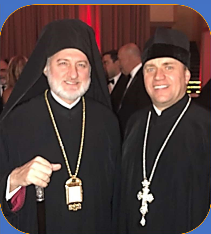
Archbishop Elpidophoros of America and Father Bohdan

Metropolitan Epifaniy, as the head – the Primate – of the newly established independent Orthodox Church of Ukraine, was honored as a “Defender of the Faith” at the Athenagoras Human Rights Award Banquet on Saturday, Oct. 19, 2019, attended by more than 600 people.