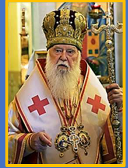
His Holiness Patriarch Philaret