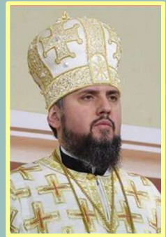
The Blessed Metropolitan Epifaniy