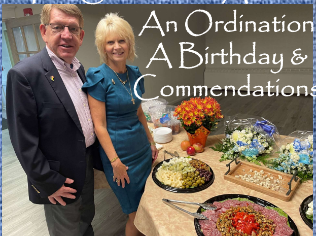
An Ordination A Birthday & Commendations