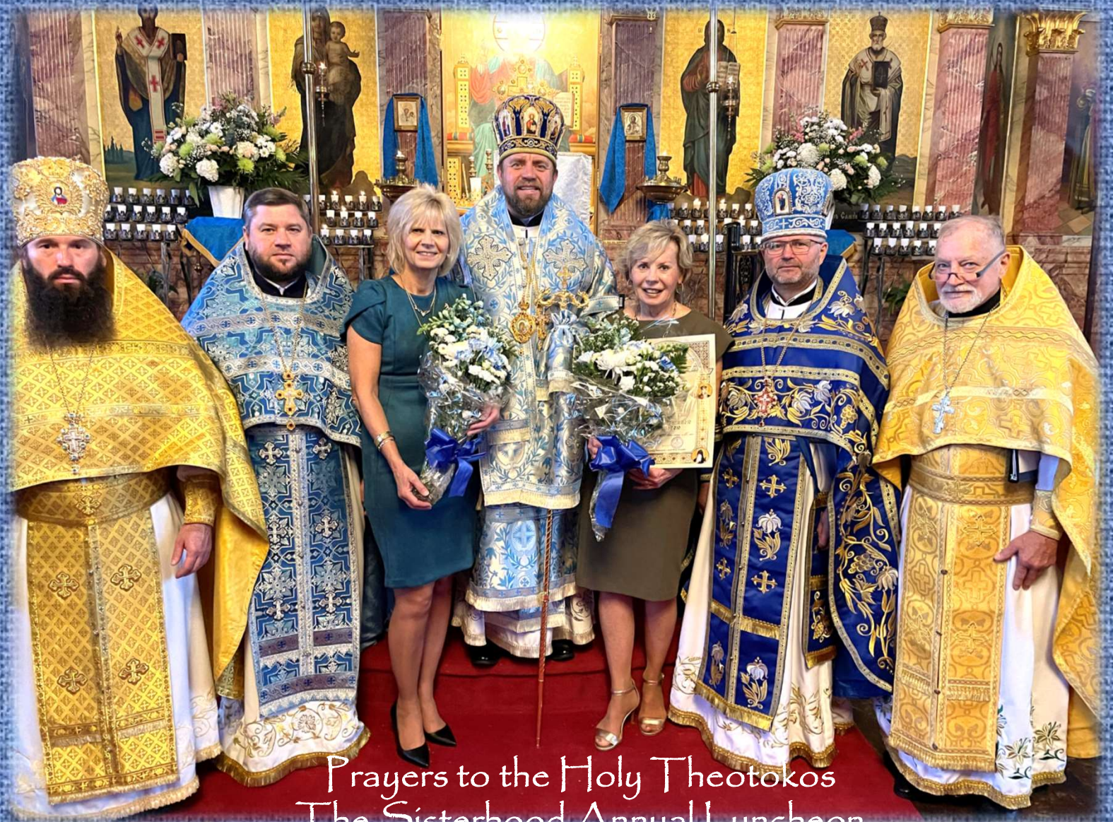
Prayers to the Holy Theotokos The Sisterhood Annual Luncheon