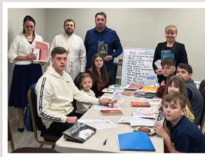
Sunday School 2022