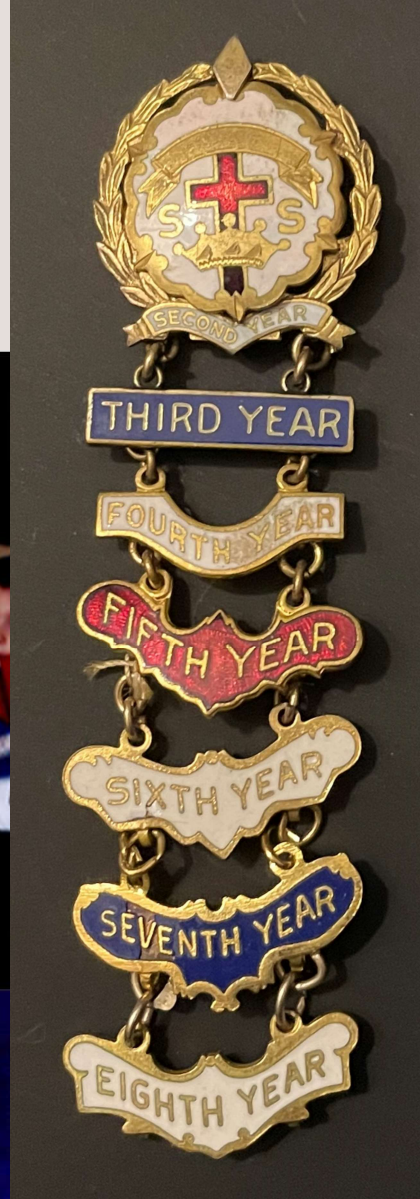
This writer's Sunday School medals received at Sts. Peter & Paul Orthodox Cathedral, Jersey City, NJ, during the 1950s-60s – still meaningful and cherished after all these years.