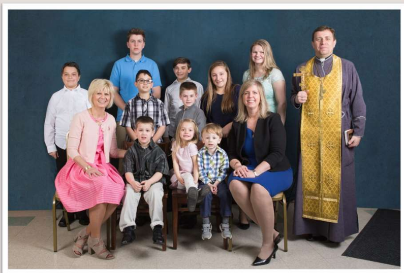
Sunday School 2017

Sunday School at St. Nicholas Cathedral was -- and is -- an essential part of every young Orthodox Christian's life.