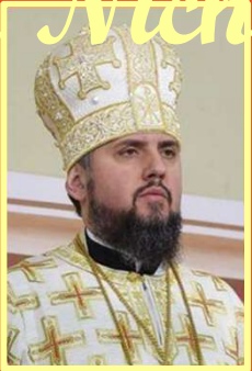
The Blessed Metropolitan Epifaniy