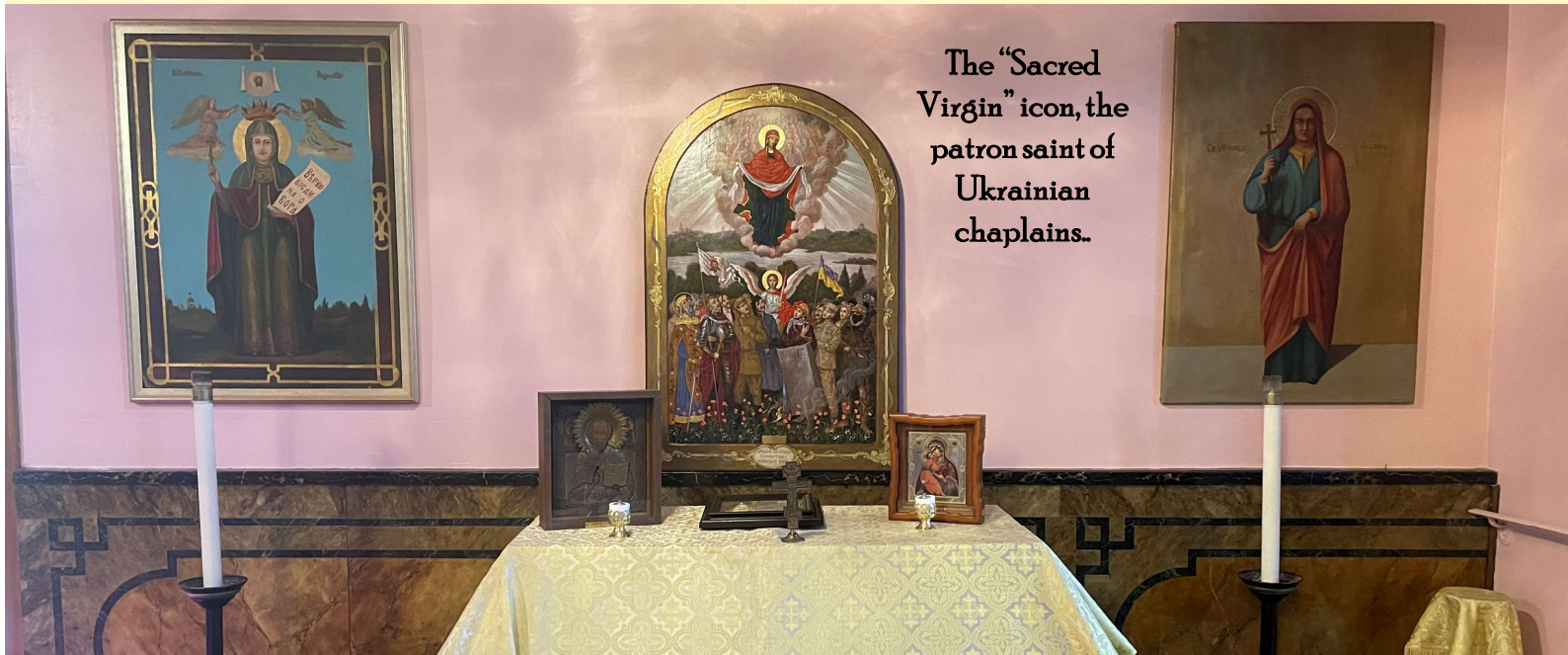
The “Sacred Virgin” icon, the patron saint of Ukrainian chaplains.

Last week, on two particularly hot and humid days with no breeze, the Hawthorne Painting crew worked in 90-degree heat – and always with a smile! The guys repeatedly said they were blessed to be part of the restoration of St. Nicholas Cathedral and often asked about the icons and our church history. The same team restored the front of the Cathedral, including the columns, in 2020 – and returned this year to do the exterior and interior painting.