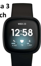
FITBIT Versa 3 Smartwatch