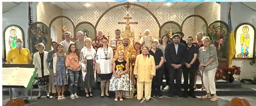
The Clergy and Parishioners of St. Nicholas Orthodox Church, Homewood, Illinois, in a photo taken July 17, 2022.