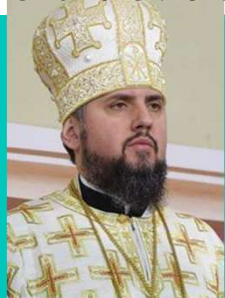
The Beatitude Metropolitan Epifaniy