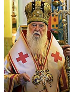
His Holiness Patriarch Philaret