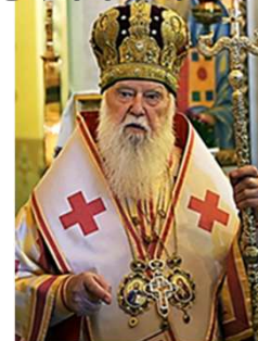
His Holiness Patriarch Philaret