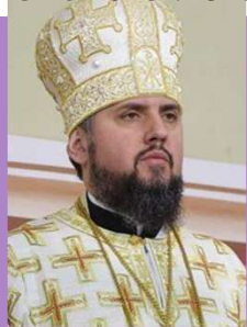
The Blessed Metropolitan Epifaniy