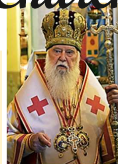
His Holiness Patriarch Philaret