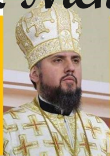
The Blessed Metropolitan Epifaniy