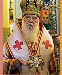
His Holiness Patriarch Daniel