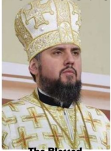
The Blessed Metropolitan Epifaniy