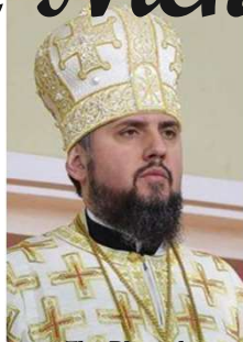
The Blessed Metropolitan Epifaniy