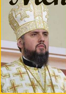
The Blessed Metropolitan Epifaniy