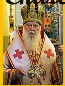
His Holiness Patriarch Philaret