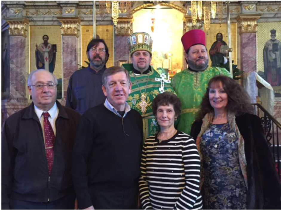
Clergy and the Church Council pose for a photo in the sanctuary prior to commencement of the Council's Budget Meeting on Sunday, February 10.