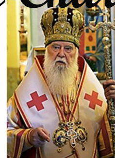
His Holiness Patriarch Philaret