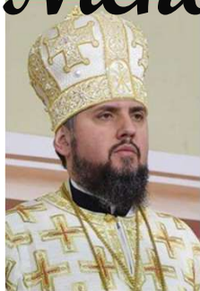
The Blessed Metropolitan Epifaniy