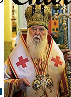
His Holiness Patriarch Philaret