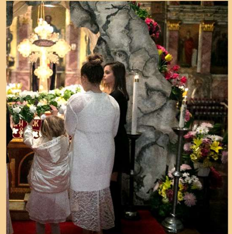
Photos: Good Friday, 2018