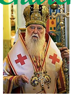
His Holiness Patriarch Philaret