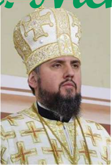
The Blessed Metropolitan Epifaniy