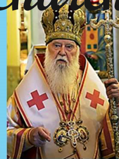
His Holiness Patriarch Philaret