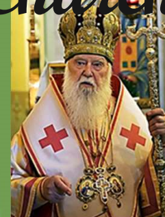
His Holiness Patriarch Philaret