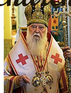
His Holiness Patriarch Philaret

Please note that during the summer months Divine Liturgy will begin at 9:00 AM.