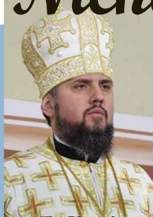
The Blessed Metropolitan Epifaniy