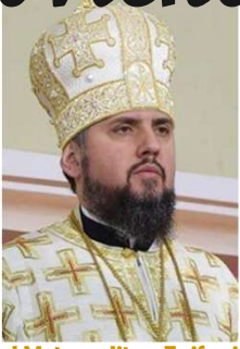
The Blessed Metropolitan Epifaniy