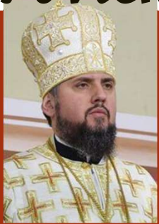
The Blessed Metropolitan Epifaniy