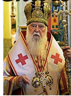
His Holiness Patriarch Philaret