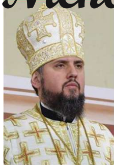
The Blessed Metropolitan Epifaniy