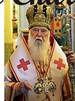
His Holiness Patriarch Philaret

"When Jesus went ashore, He saw a large crowd, and He felt compassion for them because they were like sheep without a shepherd; and He began to teach them many things." Mark 6:34