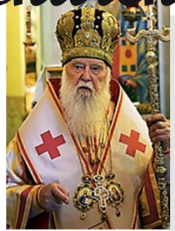
His Holiness Patriarch Philaret