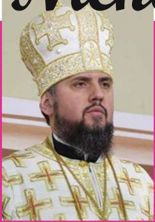
The Blessed Metropolitan Epifaniy